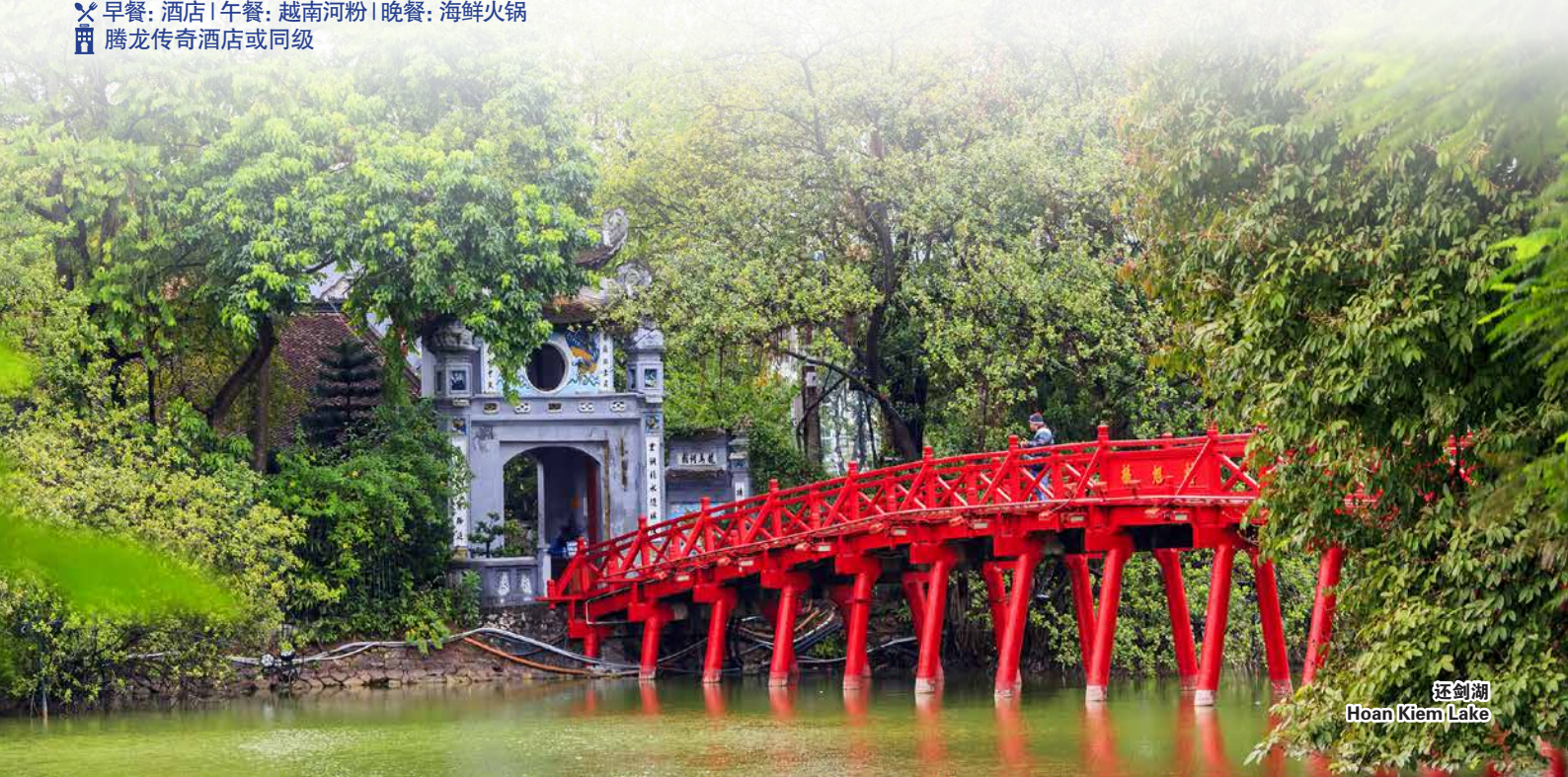
还剑湖 Hoan Kiem Lake