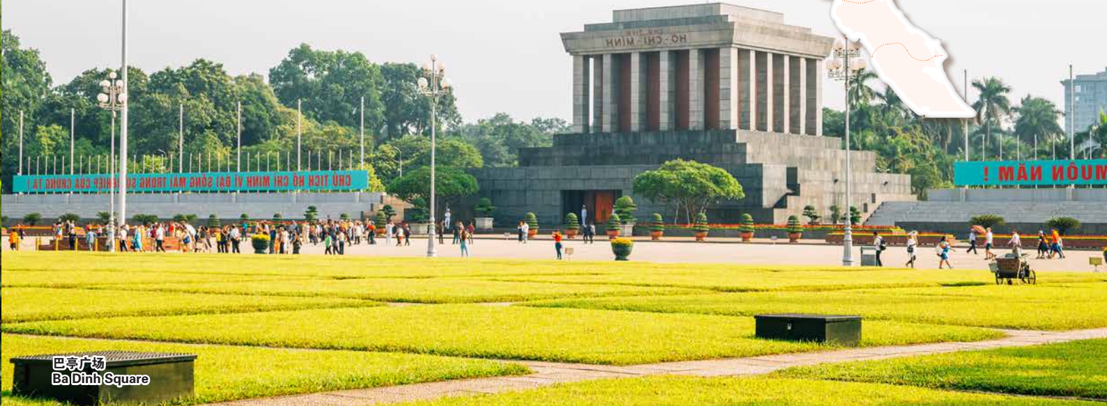
巴亭广场 Ba Dinh Square