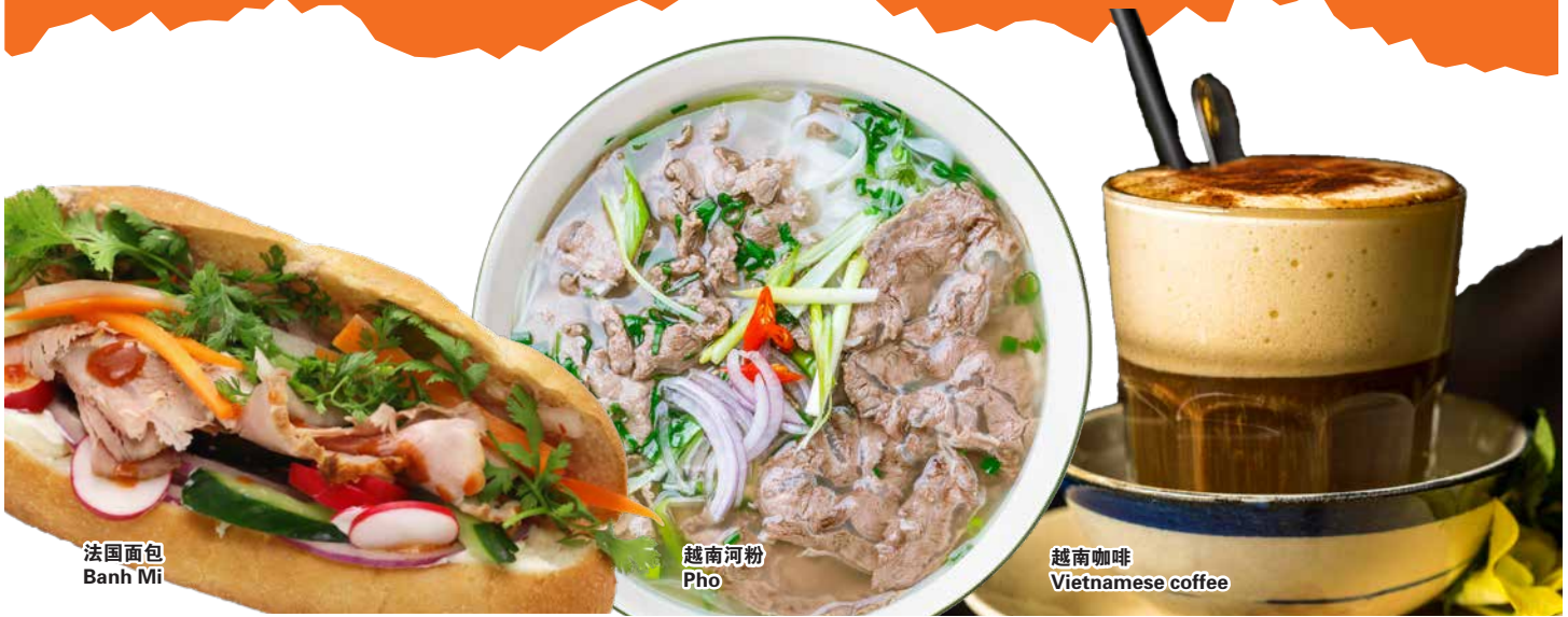
法国面包 Banh Mi

GOURMET: Bun Cha | Seafood Hotpot | Pho | SEN Buffet