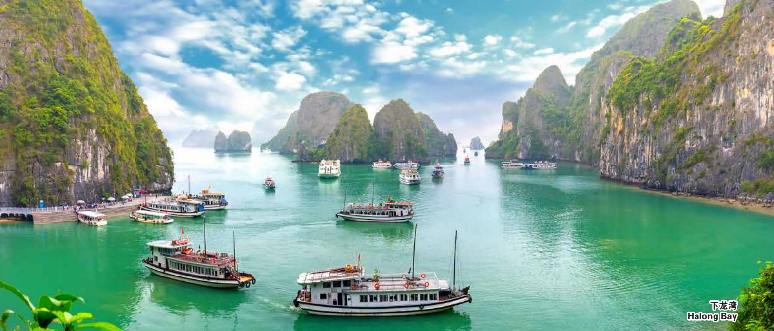
下龙湾 Halong Bay