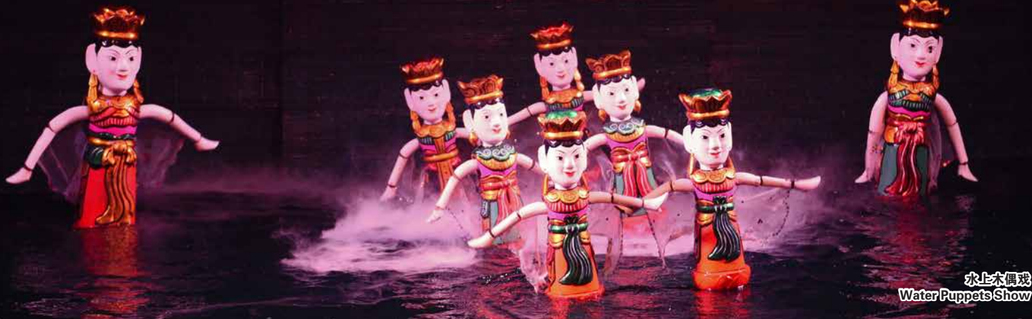
水上木偶戏 Water Puppets Show